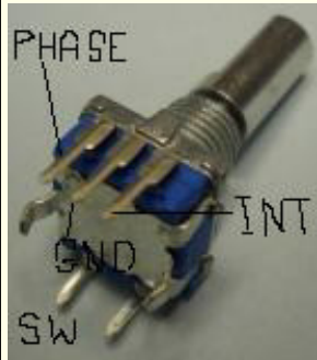
'Sureelectronics' encoder (eBay)